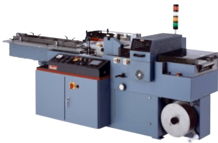
Shanklin Hy-Speed Series